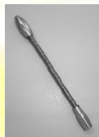
HAULING EYE BALL FITTING PART NO: 85H8 TO SUIT 10MM CONDUIT RODS MINIMUM ORDER QTY: 10