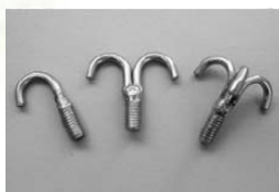
HAULING EYE BALL FITTING PART NO: 85H8 TO SUIT 10MM CONDUIT RODS MINIMUM ORDER QTY: 10