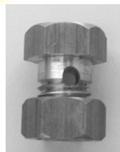
HAULING EYE BALL FITTING PART NO: 85H8 TO SUIT 10MM CONDUIT RODS MINIMUM ORDER QTY: 10